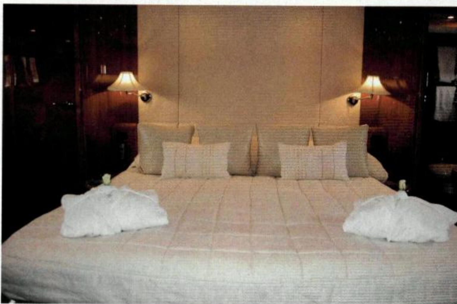
ABOVE No cabin fever onboard Princess Emma , where the beds are big and the rooms air-conditioned; (top) originally from the South of France, Emma now motors around the southern tip of Africa OPPOSITE (left) A catamaran cruiser is perfect for island-hopping in the Indian Ocean; (right, top) the interior of the Outeniqua is made with indigenous Knysna forest woods; (right, bottom) MG1 awaits its next adventure in Durban harbour PREVIOUS PAGE All this could be yours: the largest luxury yacht available for charter in South Africa

Up on the large, covered flybridge, as well as another helm – always important – there is a bar (basin, barbecue, fridge, ice-maker) and dining area. If guests are feeling particularly lazy, they can stretch out on the sunbeds on the flybridge and foredeck. Though I have a strong urge, I am a professional and I do not.