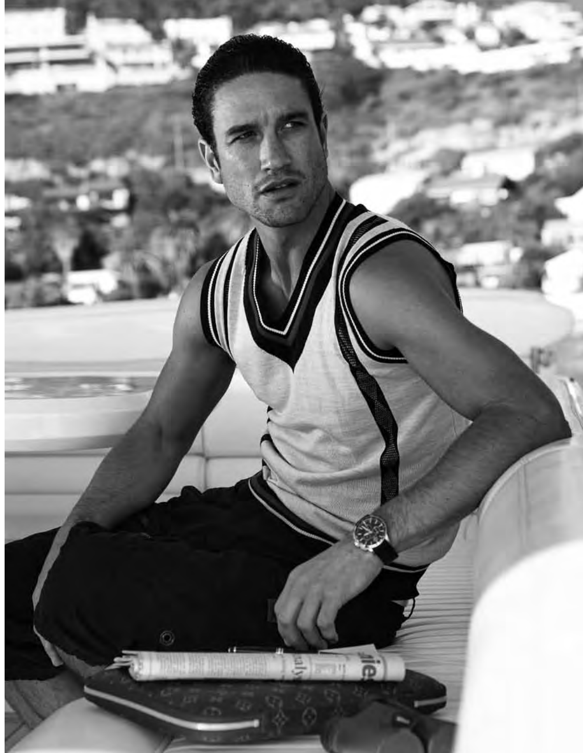
[Above] Vest R3 684, Neo. Shorts R2 999, Fabiani. Maurice Lacroix watch R11 500, S Bacher. Pen R3 310, Mont Blanc. Computer sleeve R6 550, Louis Vuitton. Nikon binoculars R4 750, Cape Union Mart. [Her] Swimsuit R675, Osiris. Ring R78 900, Shimansky. [Him] Swim trunks R1 480, Paul Smith. Maurice Lacroix watch R11 500, S Bacher.